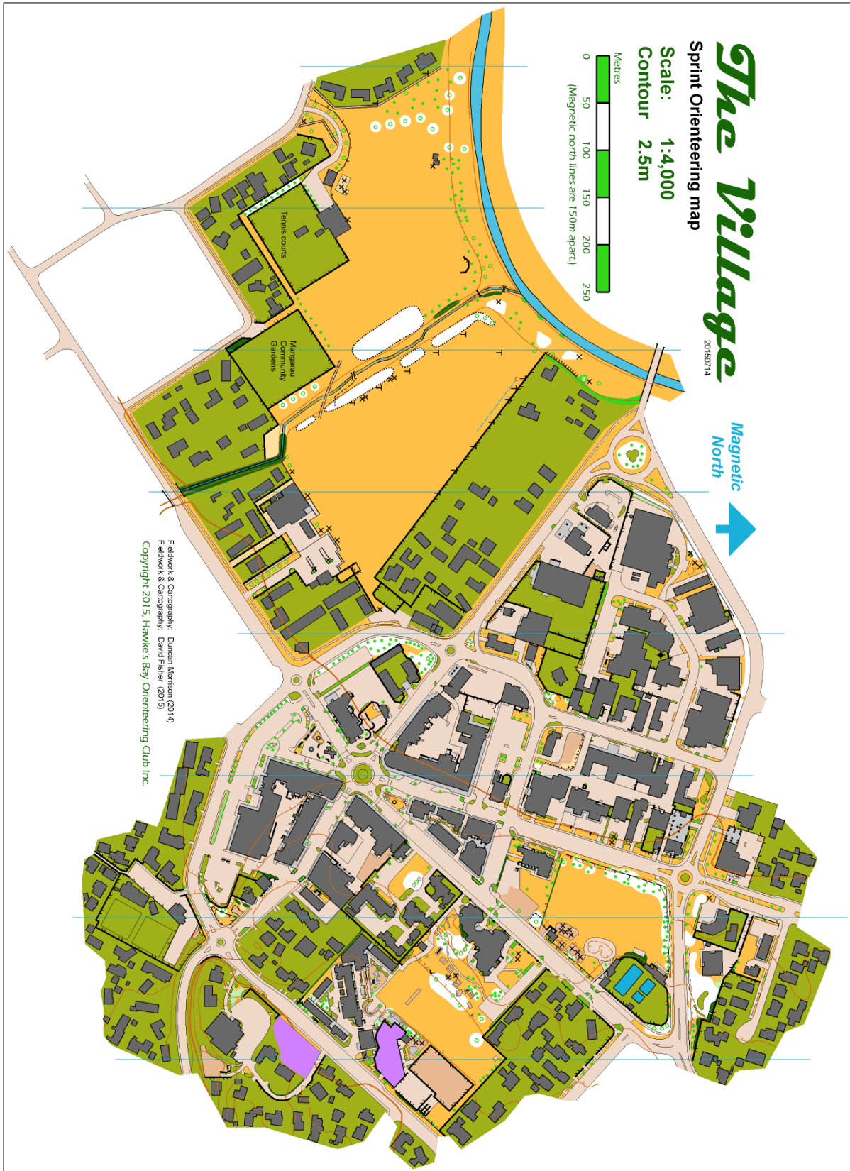
The Village (2015) - Map resized to fit on one page, not to correct scale.