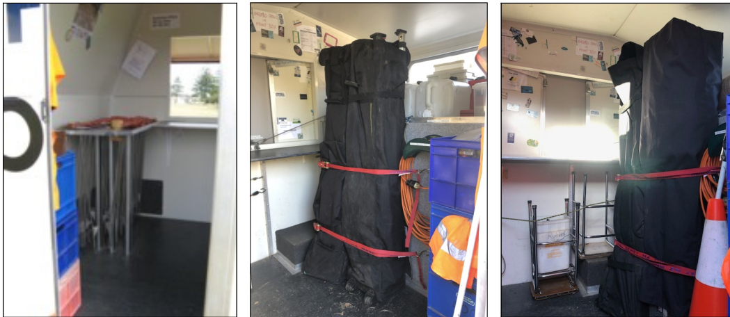
(a) View forward from door (b) View to rear from door. (c) View to rear from servery